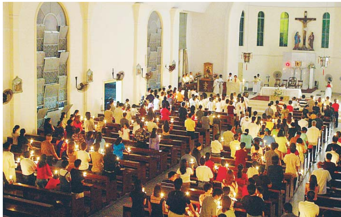
File picture of a typical Easter vigil at a Catholic church in Penang.

In this age of technological advancements, space travel, digital gadgets and fast-paced lives, how relevant is the tradition of Easter that dates back 2,000 years ago? StarMetro find out from churches and Christians in the Klang Valley what this important event is all about.